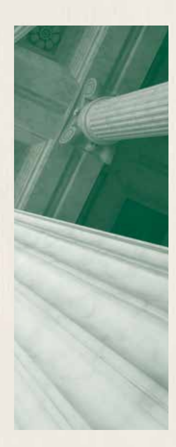
for Maryland Physicians annual report 2023